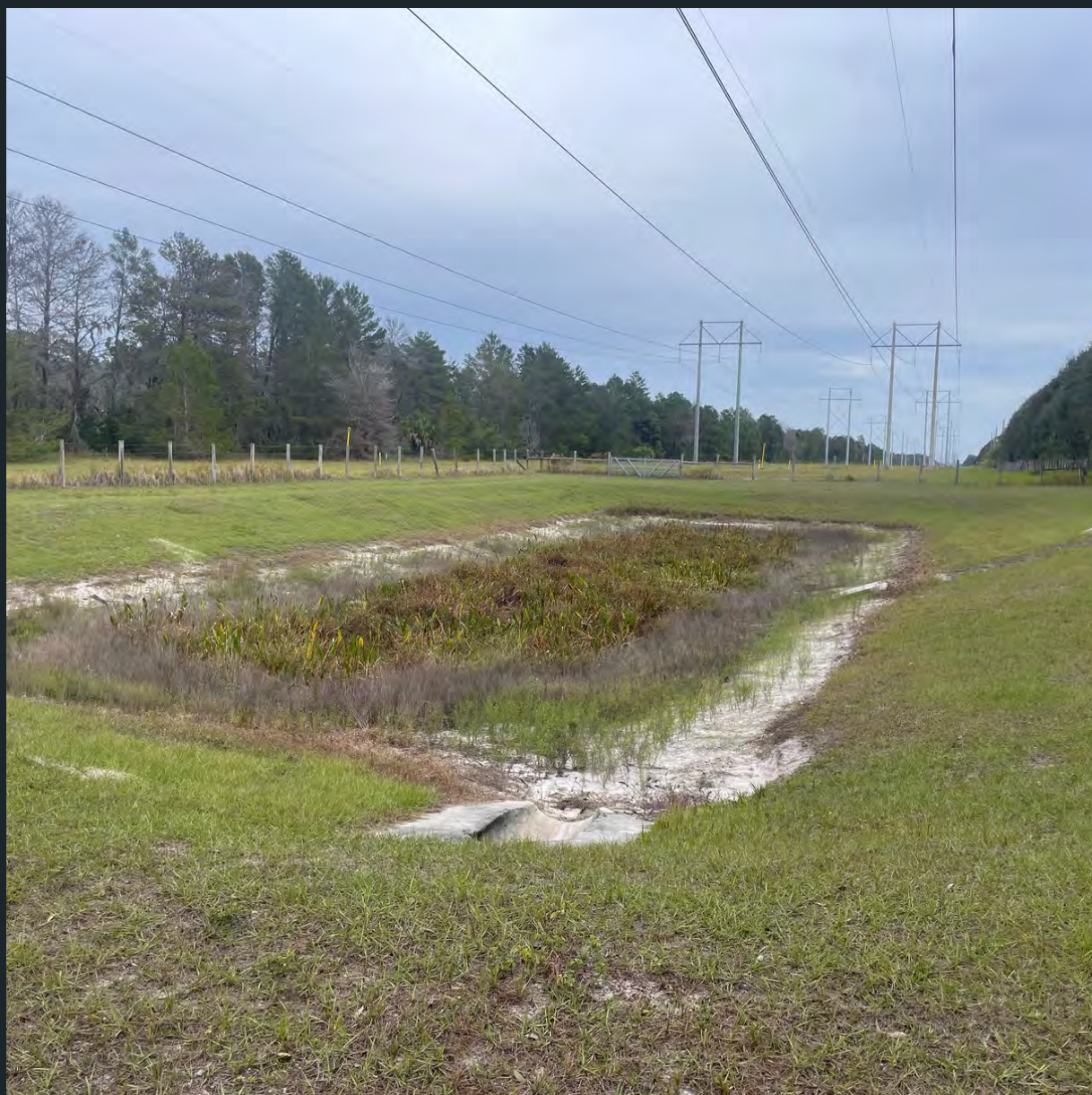
Pond #4B Treated for Shoreline Vegetation.