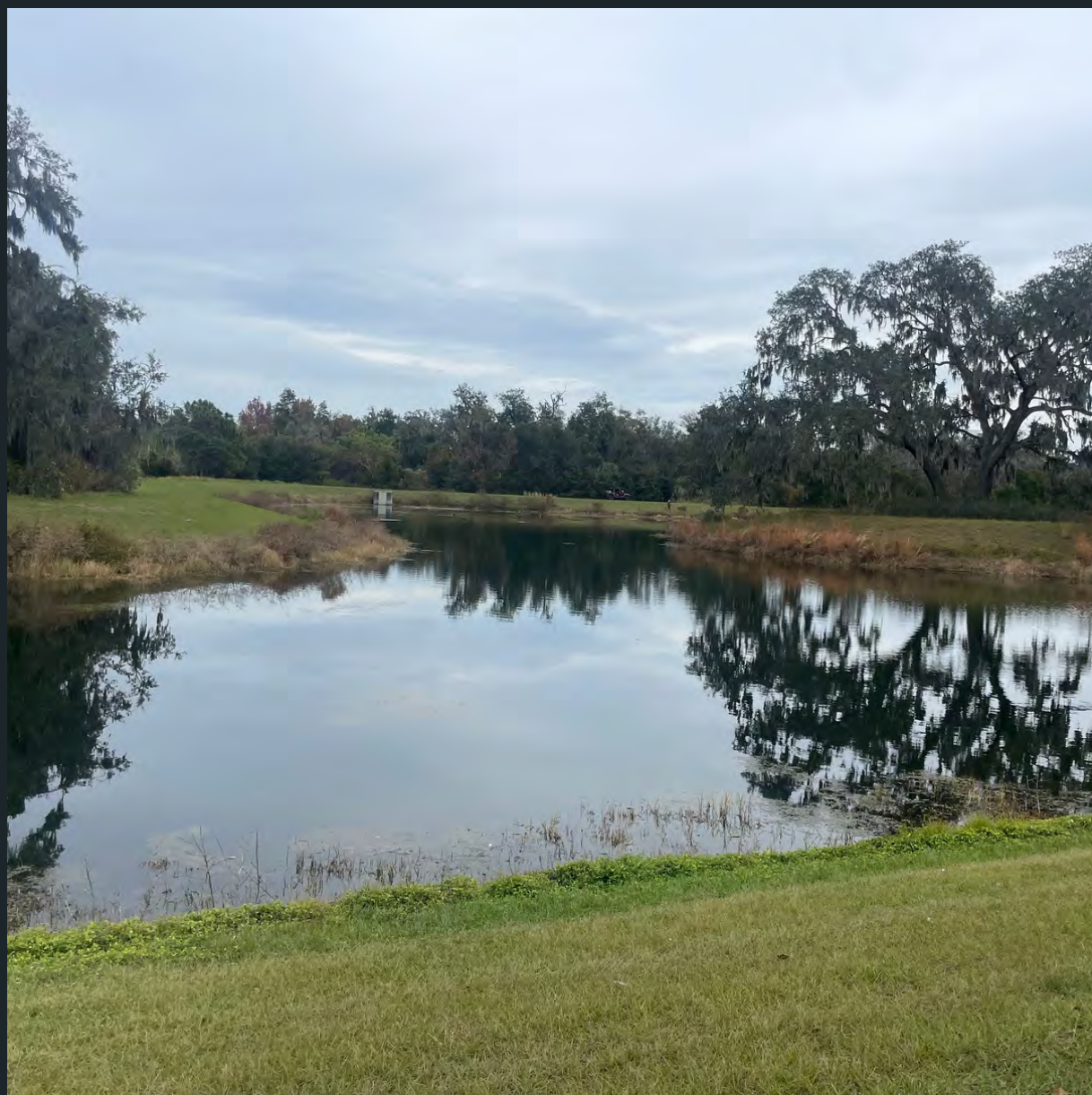
Pond #D1 Treated For Algae and Shoreline Vegetation.