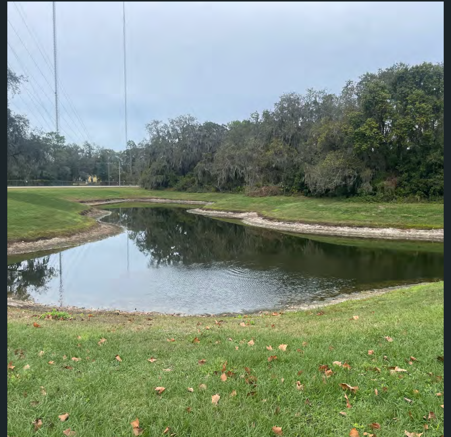
Pond #400 Treated for Algae and Shoreline Vegetation.