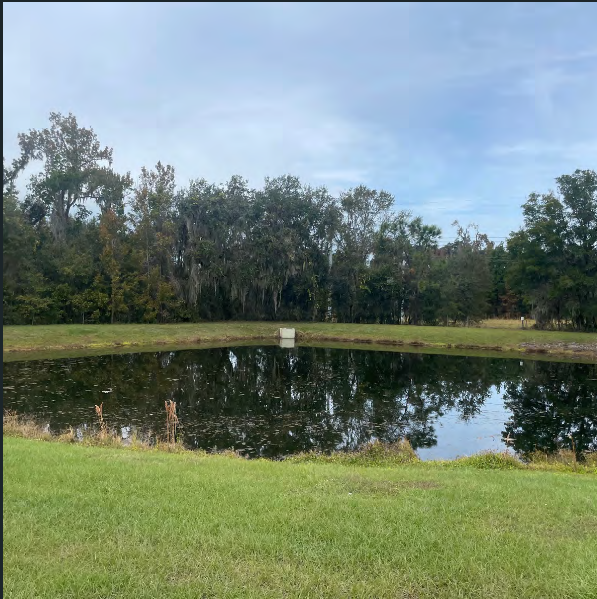
Pond #2 Treated for Algae and Shoreline vegetation.