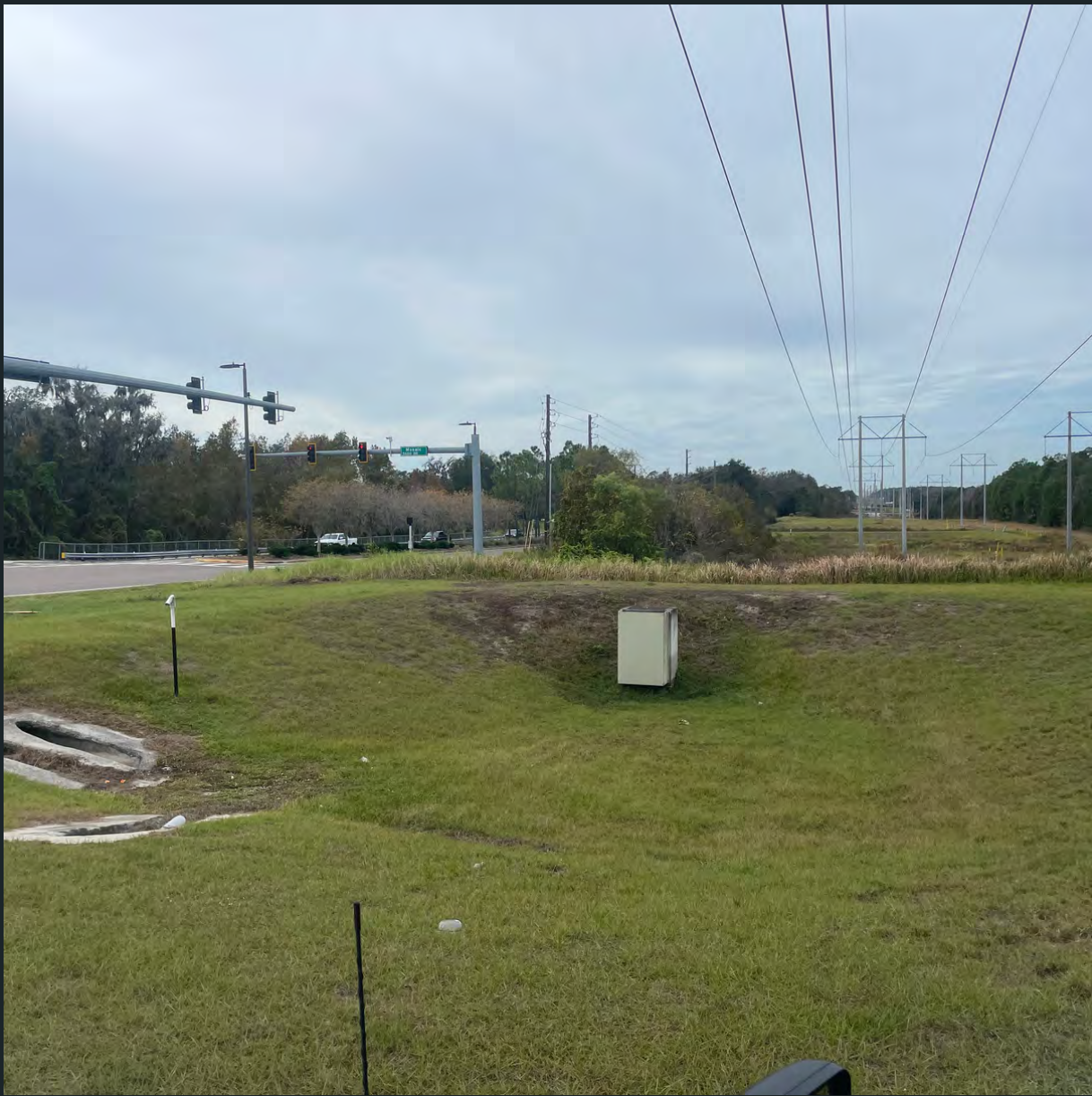
Pond #4A Treated for Shoreline Vegetation.