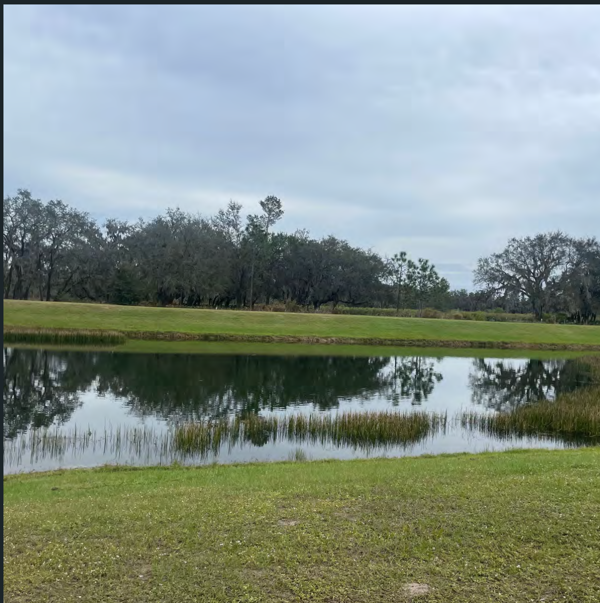
Pond #C Treated for Algae and Shoreline vegetation.