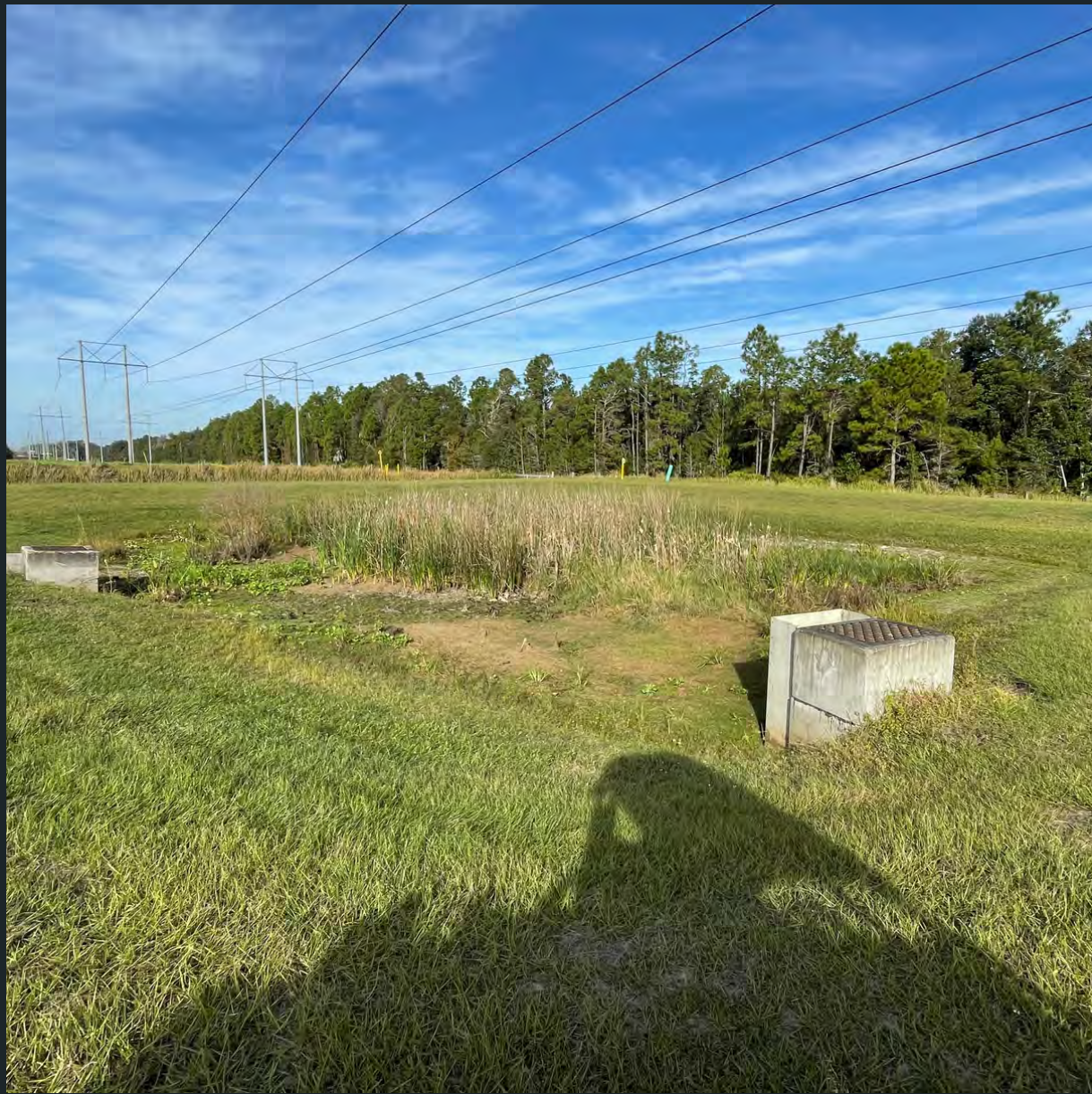
Pond #3 Treated for Shoreline Vegetation.