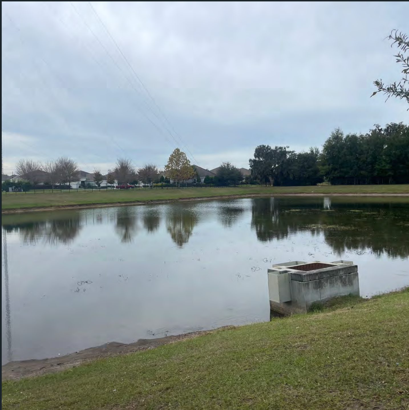
Pond #3 Treated for Algae and Shoreline Vegetation.